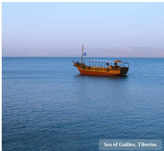
Sea of Galilee, Tiberias