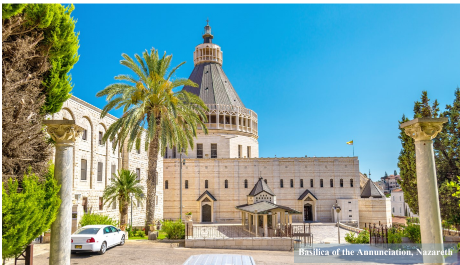
Basilica of the Annunciation, Nazareth