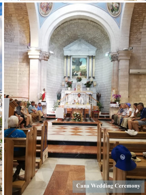
Cana Wedding Ceremony